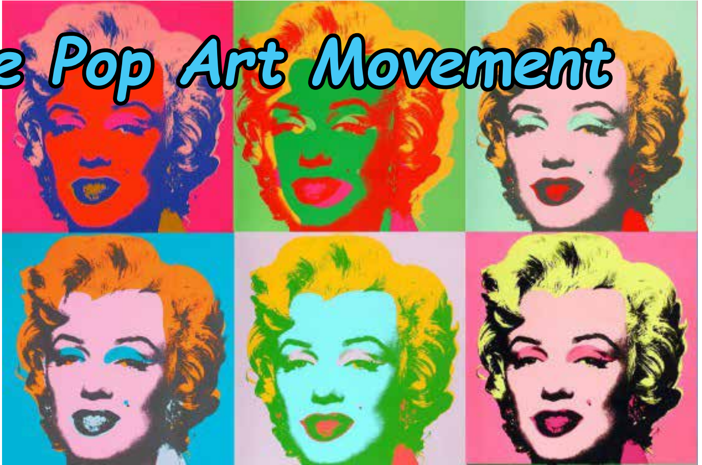
The Andy Warhol Museum of Modern Art in Medzilaborce, Slovakia.

bohemian street people, Hollywood celebrities, and wealthy patrons.